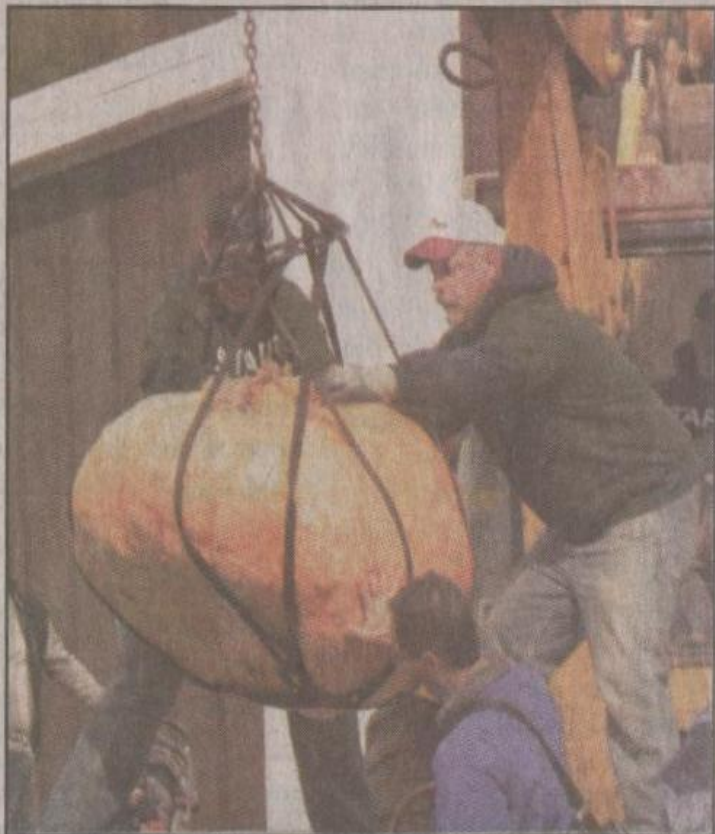
Above: A row of pumpkins sit, ready to be judged at Pumpkinville Saturday morning. Right: Staff from Pumpkinville sling a pumpkin to move onto the scale during the weigh-in.